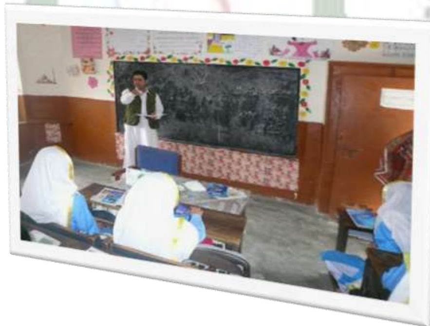
Monitoring visits of Government schools around Quetta.