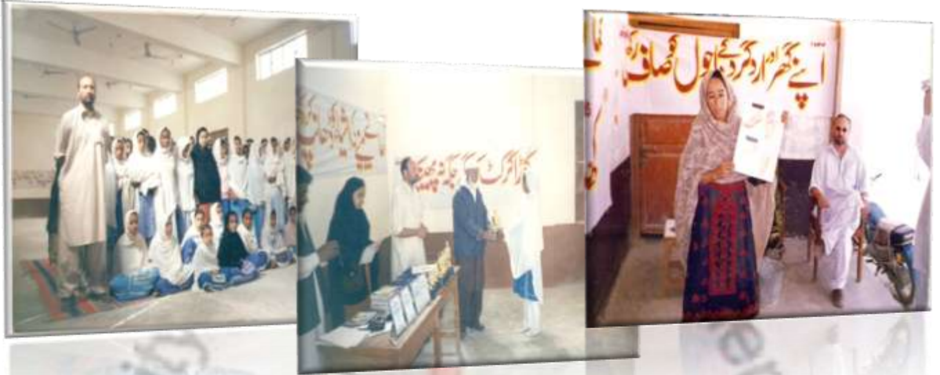
Activities conducted among the students at various schools around Balochistan.