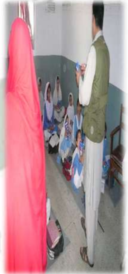
Monitoring visits of different schools as well as monitoring of development activities.